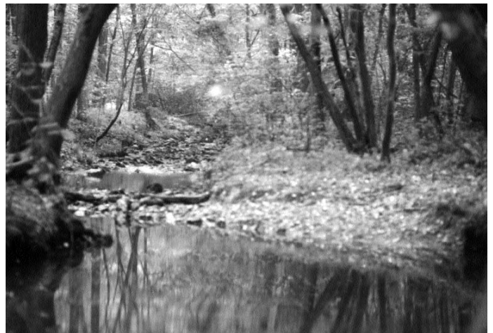
The Good Hope tributary, the primary wild trout spawning and nursery area for the entire Paint Branch fishery, near the Master Plan Alignment.

The ICC would not significantly relieve traffic through local intersections. The DEIS modeled evening rush hour traffic volumes at 54 intersections within the Study Area, and of these only 15 would improve, while more than half of the 39 remaining intersections would be operating at the worst congestion levels. Moreover, the DEIS found that between 70 and 80 percent of all the travel for each of the ICC alignments studied (Northern, Master, and Midcounty) would be made at very congested condi-