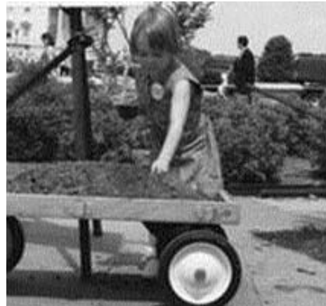
Wagon carrying equivalent of the pollution in the form of particulate matter that is generated by one eastern Montgomery County resident commuting to work in Tysons Corner for one year.

Over 10 percent of the U.S. workforce already telecommutes full- or part-time, and the numbers are growing. Recent cost-benefit analysis shows that