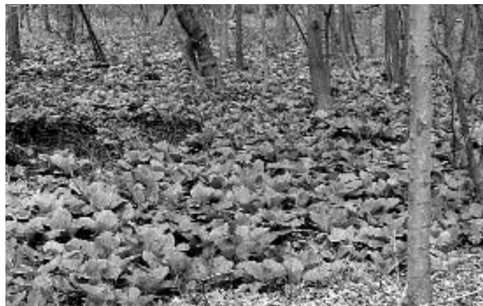
A fully functional wetland, as indicated by vegetation, in the Good Hope sub-watershed, near the ICC Master Plan Alignment.

On September 22, 1999, Governor Glendening announced his long-awaited decision on the ICC. The